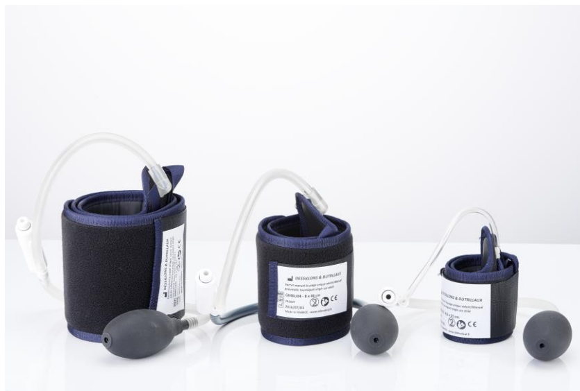
Manual tourniquet with disposable arm cuff