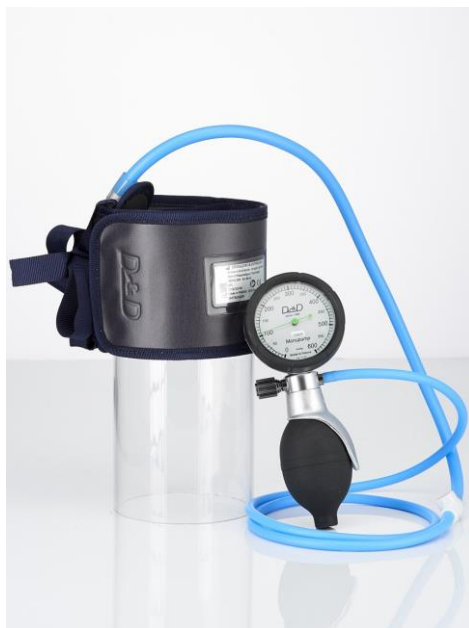
Manual tourniquet with decontaminable monobloc arm cuff