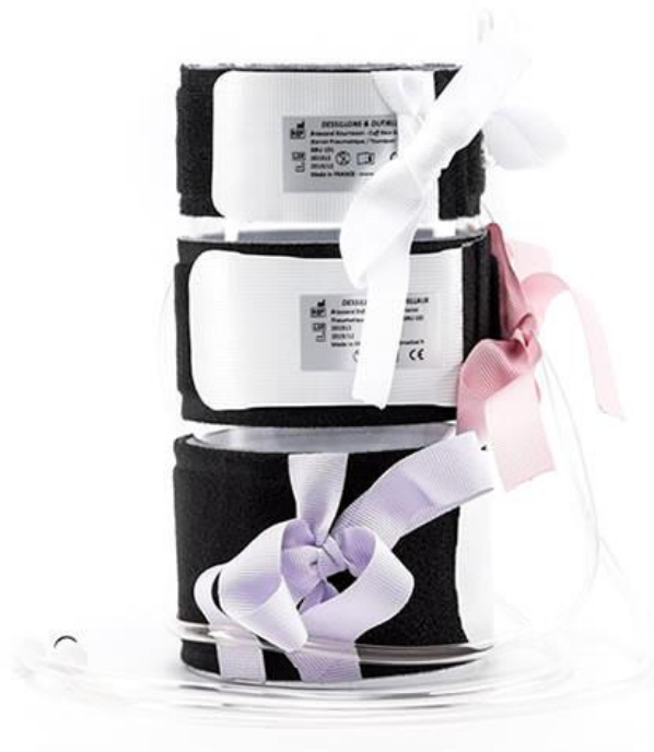
Illustration of the assembly :