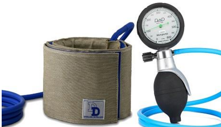
Manual tourniquet with sterilizable arm cuff

Owing to their special, robust design, it is possible to sterilise these arm cuffs and lower limb cuffs. They are composed of an envelope and a removable silicone bladder, makes it easier to maintain.